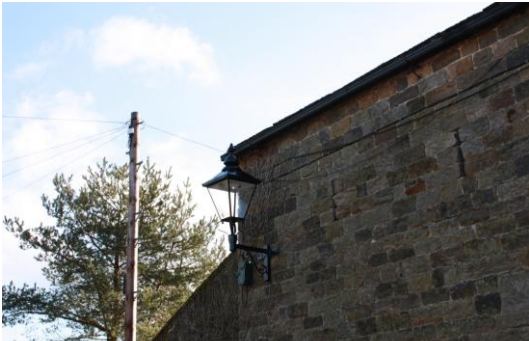
Heritage Lighting Scheme Nidderdale

require a Business Plan, so most applications for small scale work tend to be under that threshold! In the past we have supported improvements to village green areas, clapper bridges, heritage lighting and signage in and around villages. Some applicants in the past have “built in” some wages to employ a Parish Caretaker over a period of 2 years, as well as capital improvements in and around their parish.