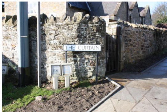
“The Curtain” setts Eppleby

The Project Co-ordinator can guide you through the process. Call 015242 51002 if there are any queries.