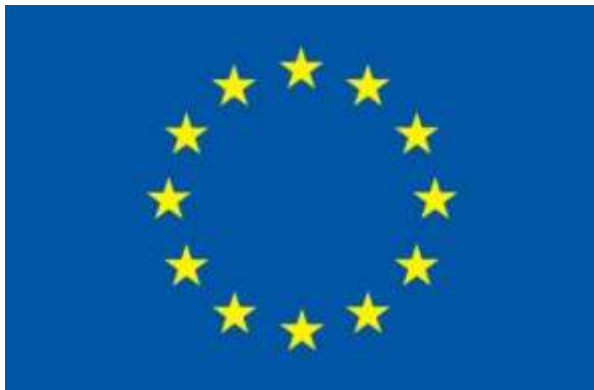
The European Agricultural Fund for Rural Development: Europe investing in rural areas

It is part funded by the European Agricultural Fund for Rural Development