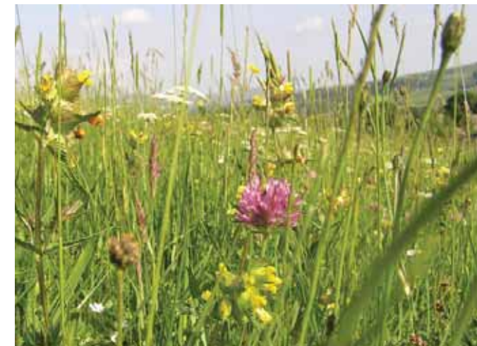
Sustaining the environment

If you would like a copy of this publication in large print format please call us on 01524 251002.