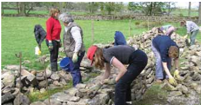
Repairing the drystone walling