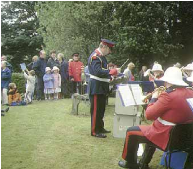
Supporting rural communities

The Yorkshire Dales LEADER programme staff send out regular newsletters, briefing and information notes, and regularly update the website. We can assist with project development and assessment.