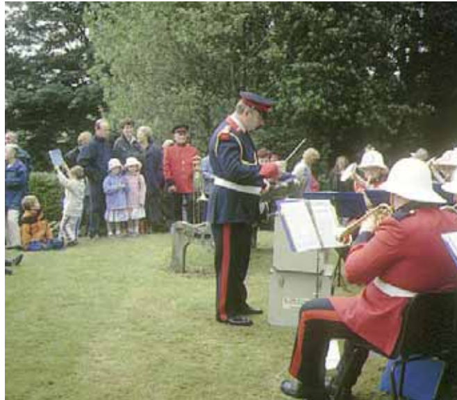
Supporting rural communities

The Yorkshire Dales LEADER programme staff send out regular newsletters, briefing and information notes, and regularly update the website. We can assist with project development and assessment.