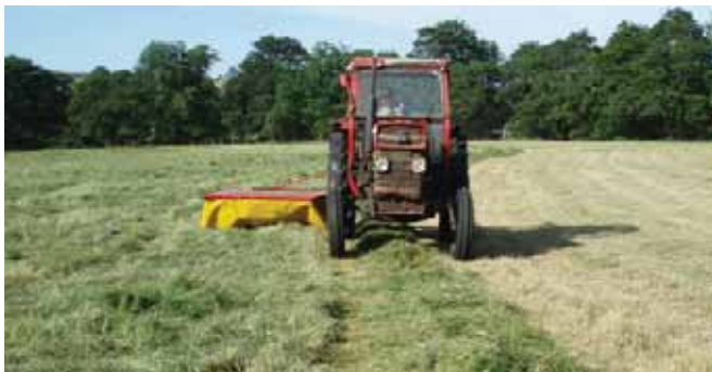
Mowing hay meadow